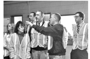
GRC Members tour the Pratt East Point MRF lead by facility staff.

of bagasse products eliminates the dependence of traditional wood fiber-based materials in disposable tableware. Since bagasse is traditionally burned for disposal, the diversion of the fiber into the making of tableware prevents harmful air pollution. The utensils were made of 80% potato starch and 20% vegetable oil.