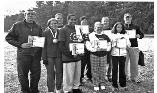
And the winners are!

On November 17th, GRC's It's Easy Being Green-Recycle! Team participated in the first Atlanta Recycles Day event in observance of America Recycles Day. In addition to their team running shirt, all participants