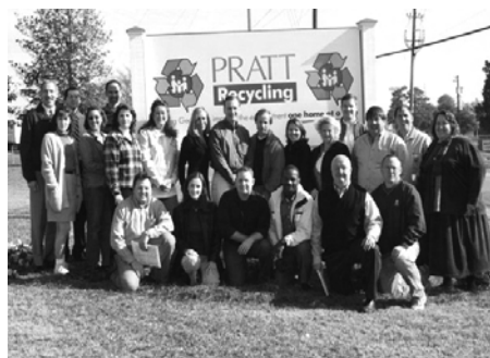
Member Forum attendees at the Dec 7th meeting hosted by Pratt.

The plates and cups used were 100% biodegradable, compostable sugar cane fiber (bagasse) that is a byproduct of the sugar refining process. Supplies of this material are virtually unlimited worldwide. The use