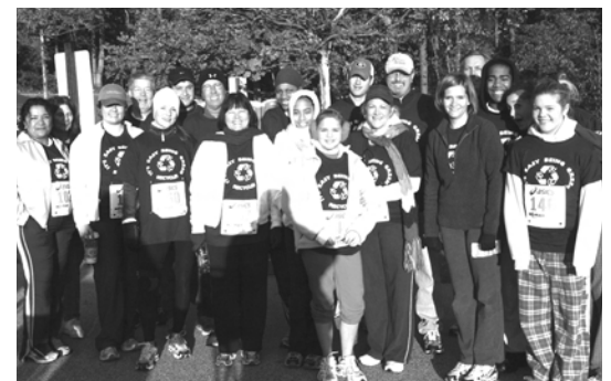
Team GRC with participants from Carastar, Conex Recycling, Community Waste Services, Georgia Dept of Community Affairs, Allied Waste, plus friends and family!

received a 100% organic cotton Greener Atlanta T-shirt and old worn running shoes were collected to recycle. Mayor Shirley Franklin spoke and presided at the green ribbon cutting ceremony to dedicate development of a recycled content running track in the City park where the event was held.