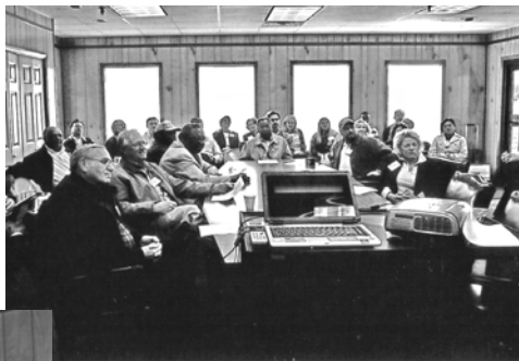
Attendees hear reports on Georgia's paper recycling industry.

GRC member Interstate Paper of Riceboro, GA hosted the 4th mill tour in 3 years for our Paper Council-Gorgia's Paper People. The goal of these events is to increase policy