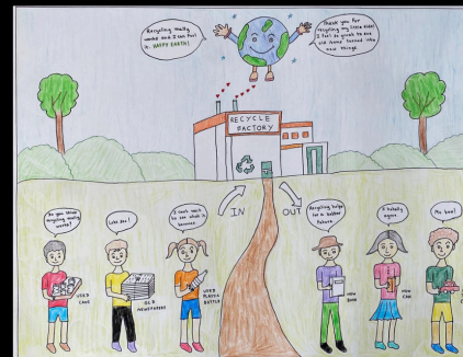
Congratulations to Aarush Suhas Mashburn Elementary - Forsyth County 2nd Place Winner: Ages 8-10 Category