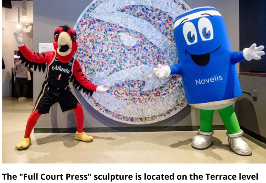
The "Full Court Press" sculpture is located on the Terrace level by the Gate 2 entrance at State Farm Arena.