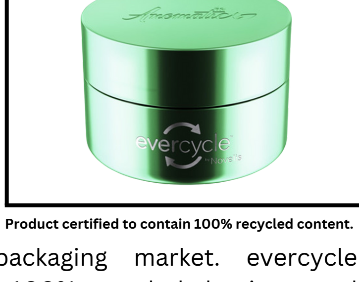
Product certified to contain 100% recycled content.

Novelis , a leading sustainable aluminum solutions provider and the world leader in aluminum rolling and recycling, recently announced it is expanding its evercycle™ portfolio to the cosmetic packaging market. evercycle Cosmetics is certified to contain 100% recycled aluminum and can achieve customers' anodized quality requirements. The new alloy offers packaging customers in the beauty, skincare and wellness space an infinitely recyclable solution compared to plastic alternatives. "With increasing consumer desire for more sustainable products, Novelis is proud to offer our customers a new packaging solution that is not only made from 100% recycled aluminum but one that can also be easily recycled again," said Jami Chime, Account Manager, Specialty Products, Novelis North America.