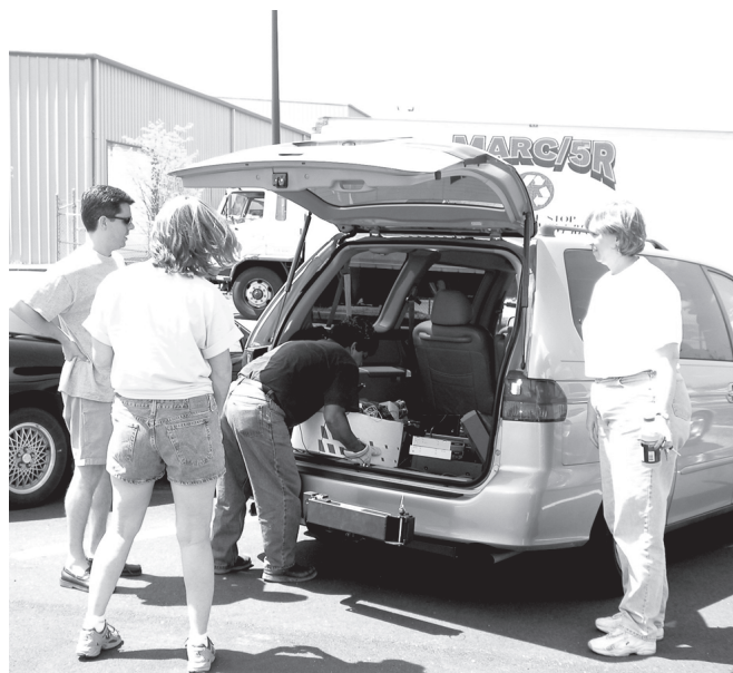
Volunteers and Keep Roswell Beautiful/Roswell Recycling Center staff assist participants in unloading computers for recycling at their April collection event.