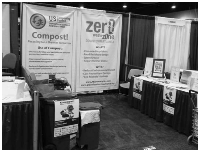
GRC exhibited as Waste Expo 2010 in May at the Georgia World Congress Center promoting International Compost Awareness Week.