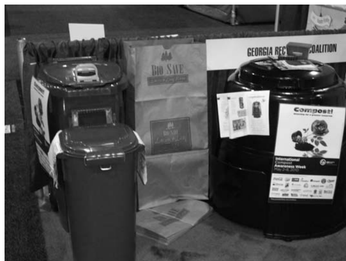
Various collection methods for yard trimmings and food residuals were demonstrated in the booth, along with backyard composting options; collateral information on composting at home was distributed.