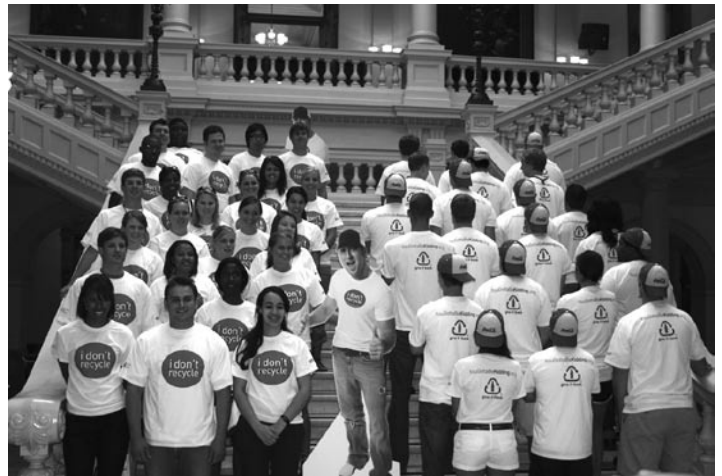
Coca-Cola Interns pose with "Tommy" in the state Capitol.

Georgia Recycling Coalition (GRC) spearheaded a "Recycling Expansion Day" event on June 3, 2009 to deploy recycling bins, posters, and instructional fliers into the Georgia State Capitol and Capitol Hill state buildings; Coca-Cola interns from across the country worked with the Georgia Building Authority (GBA) and Georgia General Assembly staff to place the bins and distribute