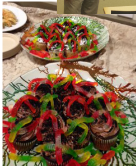
Compost cupcakes with gummy worms were a hit!