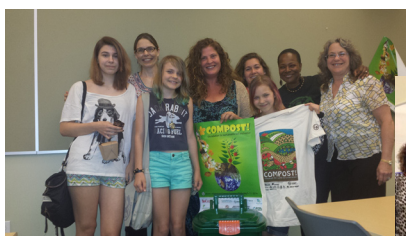
Great soil/water related door prizes were given away.