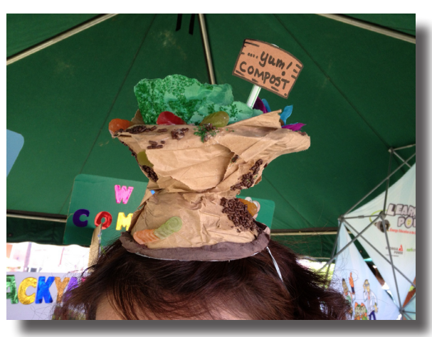
Worm Composting hat worn by a volunteer during the event.