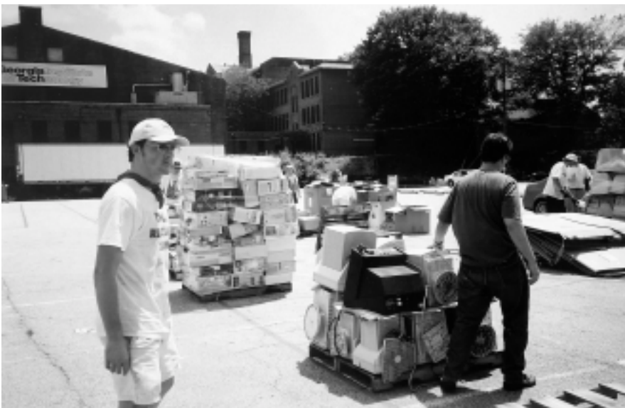
Volunteers unloaded, stacked and shrink wrapped 74 tons of computers and peripherals at the July 12 Dell Computer Recycling event at Georgia Tech. See story on page 8.

The Georgia Recycling Coalition (GRC) is a non-profit, tax-exempt organization that was formed to complement and coordinate the activities of professionals, organizations, government agencies and individuals related to recycling; to foster communications among those groups; to promote sustainable reduction and recycling programs; and to provide a forum to and from which its membership may enhance recycling efforts in Georgia.